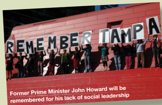
Former Prime Minister John Howard will be remembered for his lack of social leadership