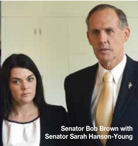
Senator Bob Brown with Senator Sarah Hanson-Young